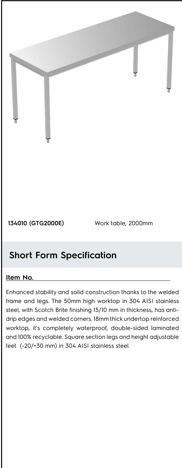
134010 (GTG2000E) Work table, 2000mm